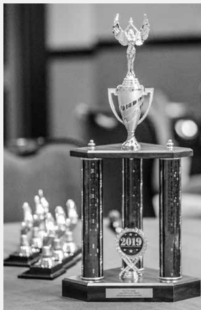
The Master Point Press Sportsmanship Award will be voted on and given out at Saturday's closing ceremony.