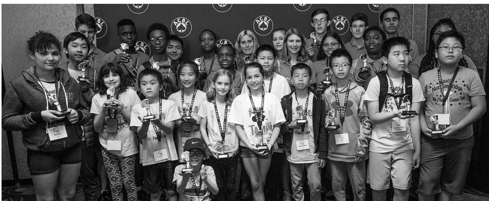
These players won section tops in various games on Thursday.