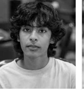
"I just like it. I like interesting."